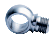
Plug (Stainless steel)