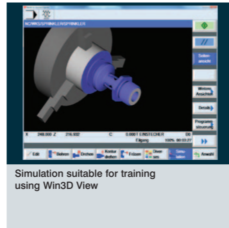
Simulation suitable for training using Win3D View