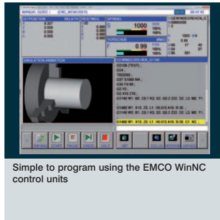
Simple to program using the EMCO WinNC control units