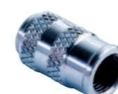
Valve cap (Stainless steel)