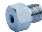
Fitting (Stainless steel)