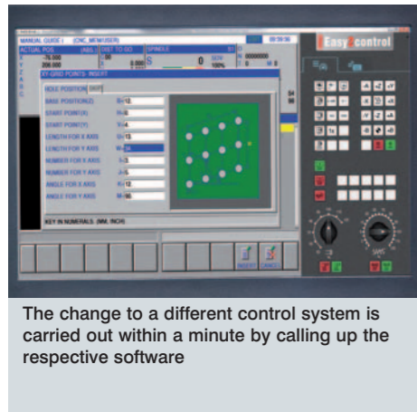
The change to a different control system is carried out within a minute by calling up the respective software

The concept of the interchangeable control unit, which can be fitted to all Concept machines, is unique. It enables the user to be trained on all CNC industry controls that are common on the market needing just one machine. The result: The CNC technicians can be applied more flexibly, which provides a significant competitive advantage for both the company and employees.