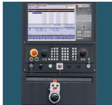
Easy2control with Easy2operate

The machine is equipped with the Easy2control operating concept. It displays the control-specific keyboards of WinNC controls on a 16:9 Full HD screen. Tabs are used to toggle between the different operator panels for machine, control unit and shortcuts. Operators may use the mouse or their fingers to operate the buttons.